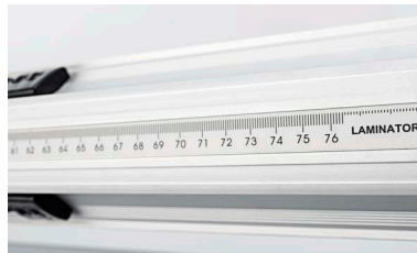
Millimeter scale on each shaft for the right positioning of the media