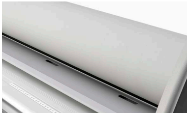
Antisticking silicon roller