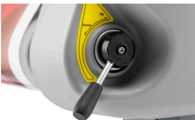
Pneumatic lifting and lowering of the roller with lever