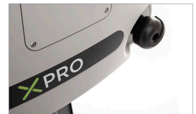
Adjustable lamination pressure