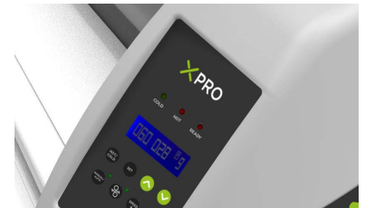
Simple and intuitive control panel